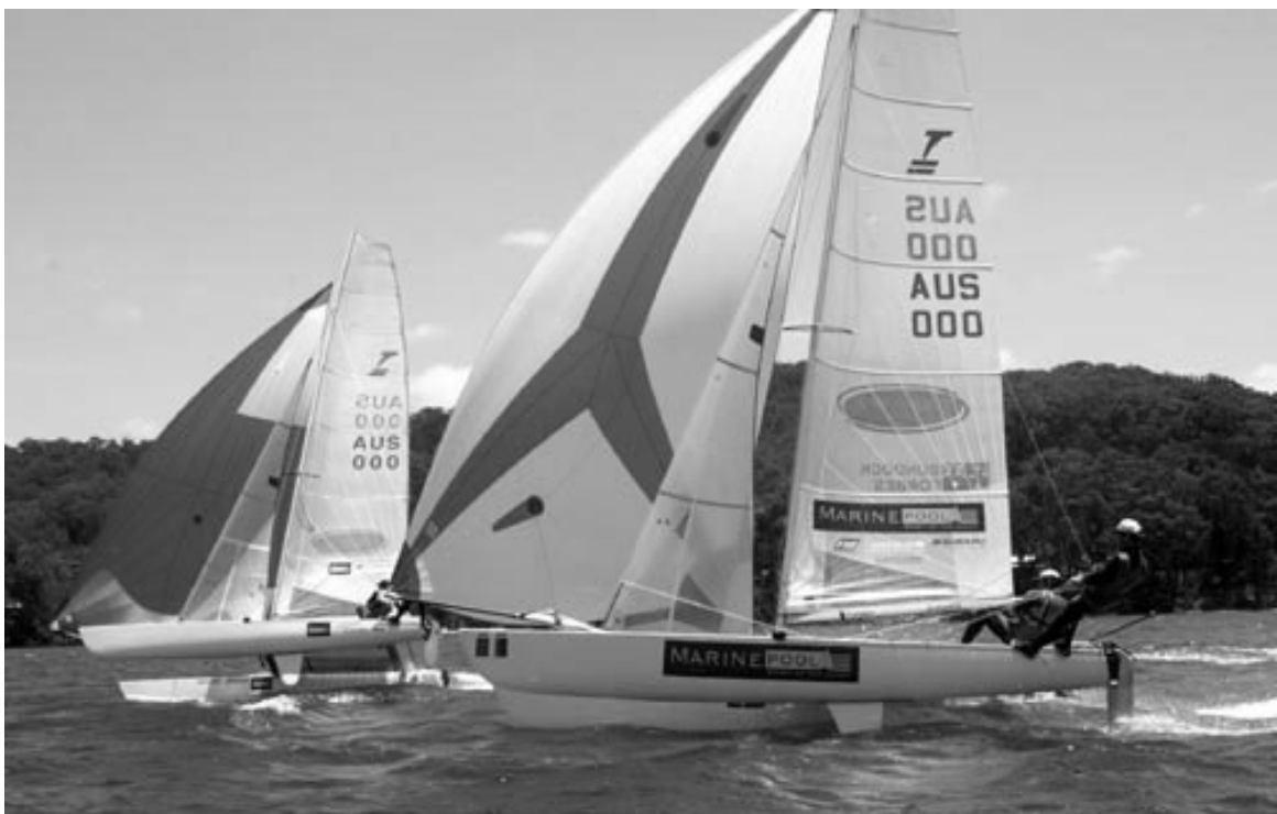
Australian Olympic team training in Sydney... pre-Athens Olympics

A website for the event is also under construction with links to all relative local and international sailing associations and clubs.