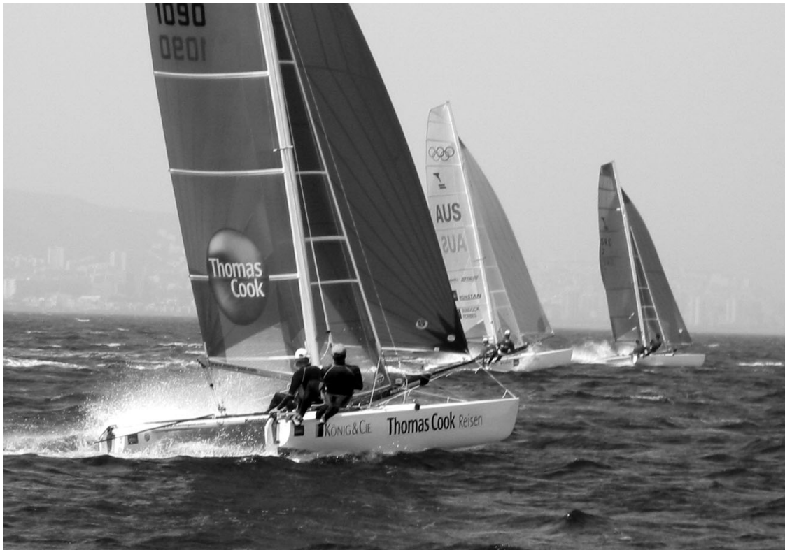
2004 world titles in Palma , Majorca , Spain....75 boats from 21 counties competed.