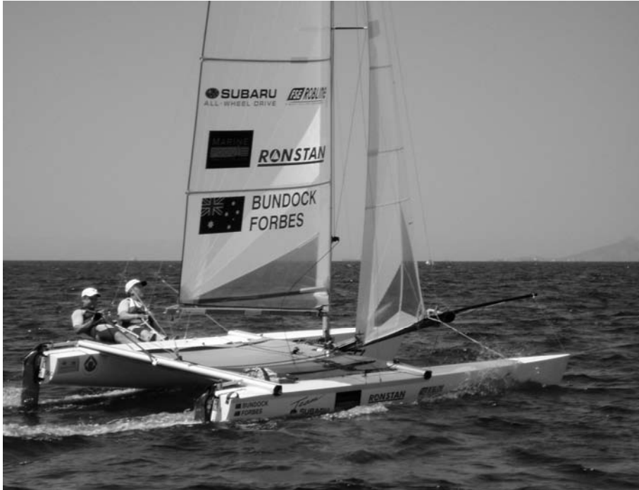
Australians Darren Bundock and John Forbes , Olympic medalists, 5 Times world Tornado champions and multiple European title winners